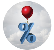
Interest on other debt*

*Incurred since or service began before 2/15/2020