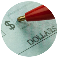
Payroll Costs & Benefits

You should only use the funds to pay qualifying (not necessarily forgivable) expenses.